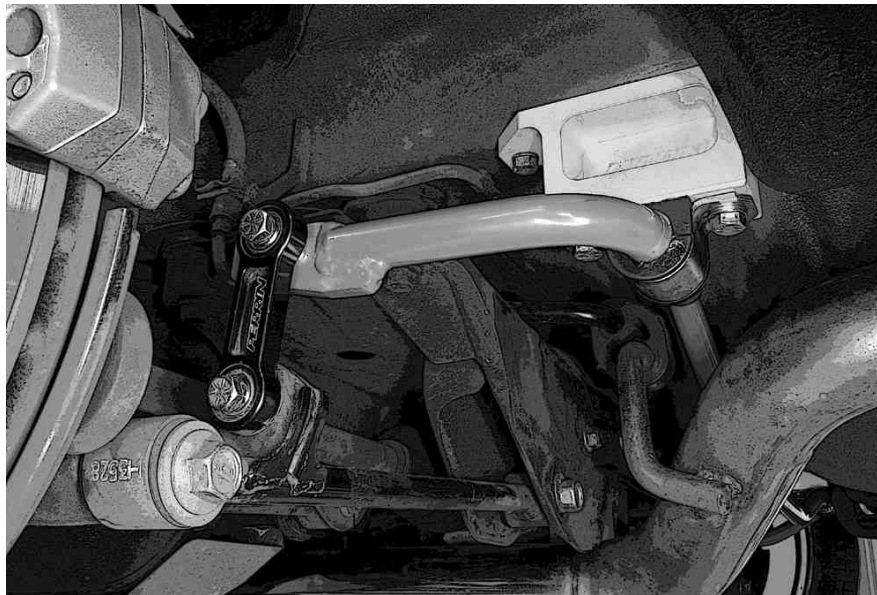
Complete sway bar, Stout Mounts, and endlinks installed

NOTE: STIFFER SETTINGS WILL INCREASE VEHICLES TENDENCY TO OVER STEER. SOFTER SETTINGS WILL INCREASE VEHICLES TENDENCY TO UNDER STEER. THE HANDLING OF YOUR VEHICLE WILL BE AFFECTED DRAMATICALLY WITH THE INSTALLATION OF THIS SWAY BAR AND THE END LINK POSITION YOU CHOOSE. DRIVE VEHICLE CAUTIOUSLY UNTIL YOU BECOME FAMILIAR AND ACCUSTOMED TO THE NEW HANDLING CHARACTERISTICS OF YOUR VEHICLE!