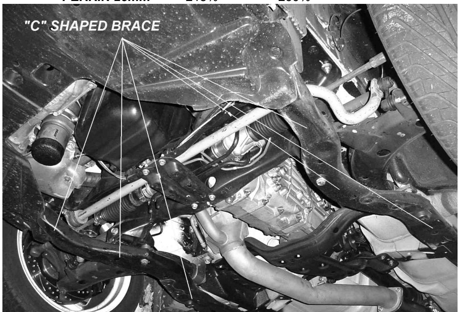
Above picture shows sub frame bolt locations. STI models may contain 1 extra bolt.